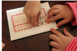
affixing a stamp