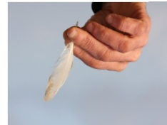
holding up a feather